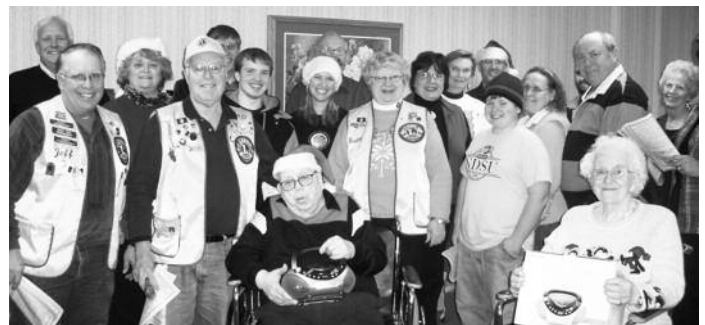
Thank you to the Lions for Christmas caroling and donating two DVD players for the residents.