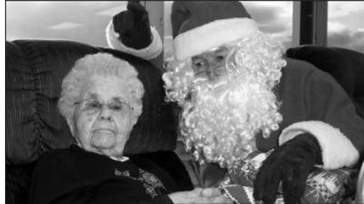
The Christmas parties were enjoyed by all – Santa was a hit!