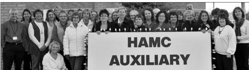
HAMC employees and residents of the Rugby area gather for the 2011 Tree of Giving Lighting Ceremony.