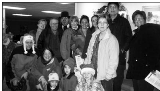
The Rugby Lions (left) and Restoration Ministries (right) brought the sounds of Christmas caroling to residents.